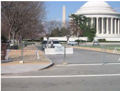
The Jefferson Memorial with the Washington Monument in the background

Finally, when a park uses detailed rangers, expenses are incurred not only for that officer's per diem and travel but, many times, for a replacement for the detailee's home park as well. Regardless of whether or not a backfill (often in the form of overtime) is necessary, the use of detailees is significantly more expensive than the cost of hiring a permanent ranger. At one park, for example, the daily cost of the cheapest detailee equaled 1 ½ times the cost of the average daily payroll of a GS 7/4 permanent ranger on overtime. It is our opinion that the use of detailees is not an adequate long-term solution to the problem.