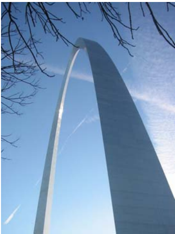
The St. Louis Gateway Arch