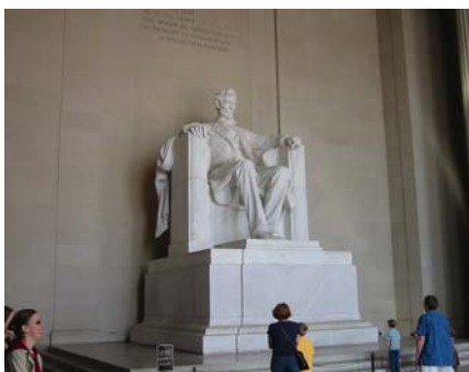
The Lincoln Memorial

left a national monument and its contract screeners without an immediate law enforcement presence. When this situation was brought to the attention of a Park Police supervisor, the supervisor's reply was, "Nothing I can do about that. The guy has to eat."