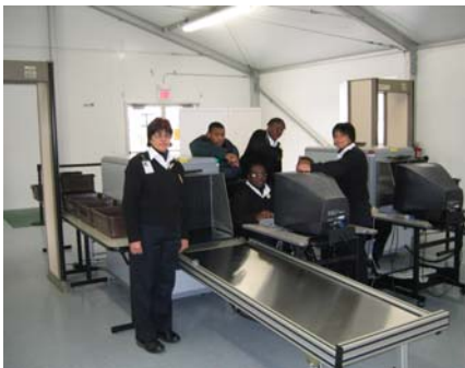
A typical screening site

Security cameras at some icon parks were located at such a lengthy distance from the monuments, for reasons having primarily to do with aesthetics and/or historic integrity, that veils of trees, along with various other impediments, actually obscured critical areas of vulnerability. While we recognize the significance of maintaining the historic nature of these parks, there has to be some room for accommodating adequate security measures, such as the aforementioned cameras. Moreover, we discovered many of these cameras remain unmonitored throughout the day and go dormant at night, relying then on motion-detection devices.