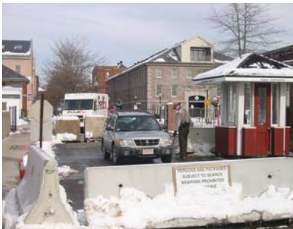
Security checkpoint at Boston Navy Yard

In short, the parks have not felt the pressure to perform, nor have they been held accountable for their noncompliance. The NPS and the Department must address these serious deficiencies within the security and law enforcement programs in order to adequately protect our national icons. Greater effort and guidance are needed in order to properly meet current security demands. Coordination and communication—two key characteristics of any well-functioning organization—are lacking. Specifically, we uncovered an over-reliance on small numbers of protection rangers and Park Police officers. Reliance on overworked and understaffed protection rangers and Park Police officers to provide satisfactory protection at icon parks is unwise. The park security workforce requires augmentation, and both current and incoming rangers and officers should receive more intense training in order to strengthen their skills and to enhance their ability to execute protection duties. Furthermore, technological solutions should be pursued, as well as the use of contract security personnel, where appropriate.