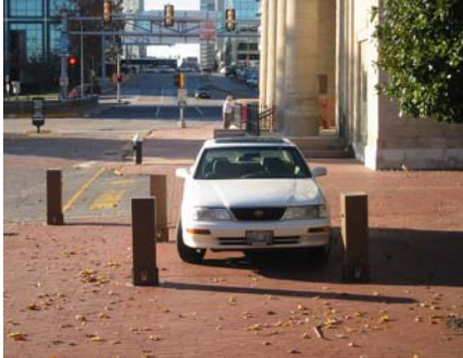
Improperly-distanced vehicle barriers

During our review, we observed security measures that appeared to have been haphazardly determined and hastily implemented. At one park, for example, we learned that security countermeasures were installed at a certain distance based on aesthetics rather than a scientific blast analysis or recognized security standards. At two other parks, we discovered an entrance gate unmanned, unprotected, and unmonitored just a short distance from what the park management advised was one of their top three vulnerable areas. Other security deficiencies included improperly-distanced vehicle barriers, inoperable security equipment, cameras without nighttime capabilities, ineffective alarm systems, exposed security wiring, and negligent security personnel.